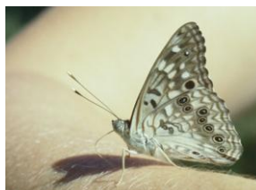
Hackberry Emperor on arm.