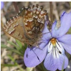
Eastern Pine Elfin

Of the 433 NABA Counts in North America, only a single Wisconsin count has found the beautiful, but Endangered, Swamp Metalmark!