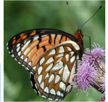
Regal Fritillary

Directions: From US Highway 18/151, a mile and a half west of Blue Mounds, turn south on Mounds View Road. Proceed on Mounds View for 2.5 miles to where it joins briefly with Prairie Grove Rd. Stay with Mounds View and go another 0.8 miles. Look for the preserve kiosk and parking on the left (east) side of the road. There are both gravel and grass parking areas off road.