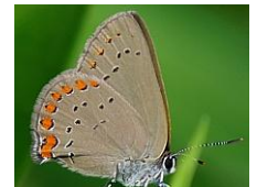
Coral Hairstreak.

Hobomok Skipper (1) only the 6th year they have been found.