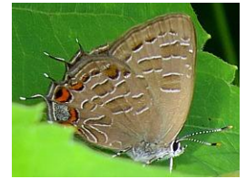
Striped Hairstreak.

We found a record 43 species and 356 individuals , in a total of 11.6 party-hours of observation.