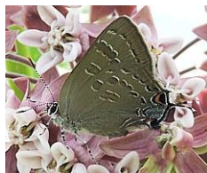
Hickory Hairstreak.

We had a good turnout with 16 people. (Sandhill is about 2 hours north of Madison.) Some folks even came from Illinois! A total of 41 species were seen by the various participants. The Hickory Hairstreak is a scarce species. We observed Racket-tailed Emeralds (dragonflies) flying up close and around people, taking the gnats and mosquitoes that we attract! This small Emerald seems amazingly fearless of people! Butterflies were so plentiful that there would often be several on Milkweed or Swamp