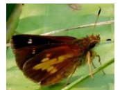
Mulberry Wing.

We found 21 butterfly species. The best sightings were Common Buckeye (a stray from the South), Gray Comma, Baltimore Checkerspot and Mulberry Wing. Many of the participants ate lunch together at the hilltop picnic shelter.