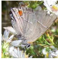
White M Hairstreak

Painted Ladies (migrants) and Little Yellows and Dainty Sulphurs (immigrants) turned up occasionally. Giant Swallowtails were disappointing. We expected a better showing in such an outstanding butterfly year. Several of the extremely rare immigrant, Sleepy Orange , were seen on SWBA's Avoca and Lower Wisconsin Riverway Trip in August. The usually rare northern species, Green Comma ,