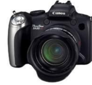
Canon SX20 IS

The best rated zoom cameras were Canon Powershot SX20 IS and Panasonic Lumix DMC-FZ35. The Nikon Coolpix P100 was 3rd.