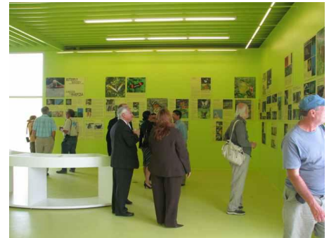
Interior of Visitor's Pavilion

The new Visitor's Pavilion, opened in a ceremony on October 28, is very impressive. The facilities are spacious and there is a pleasant pervasive green color on the inside! Of course there remains much to do yet, but it's a very exciting beginning for education of the public about butterflies.