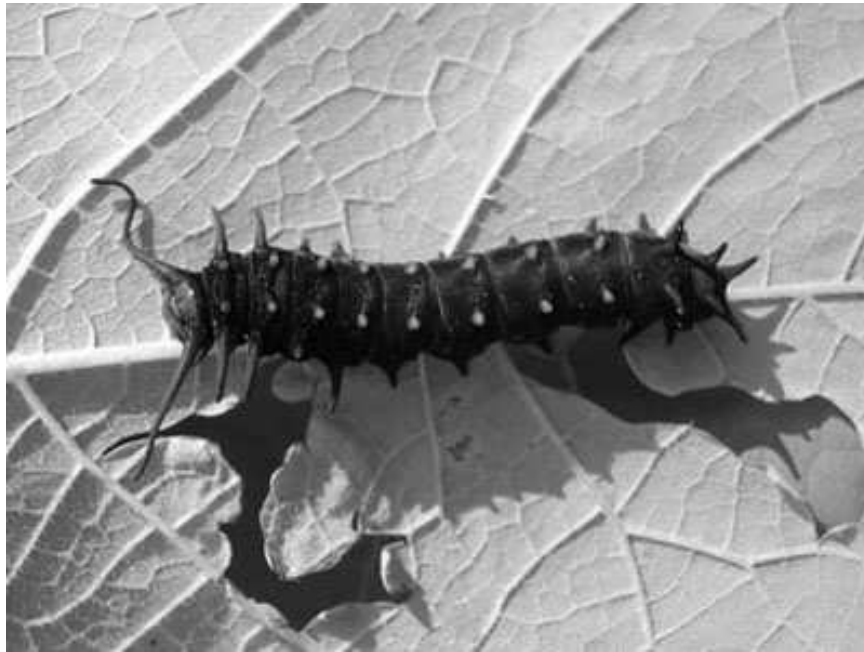
Pipevine caterpillar, Lakeville MA, July 2004