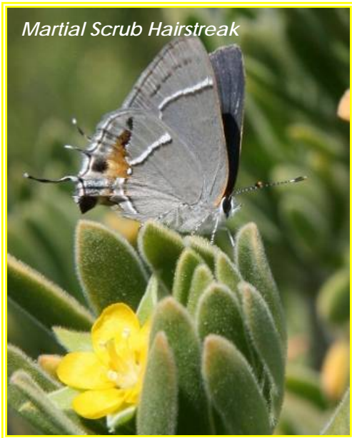
Martial Scrub Hairstreak