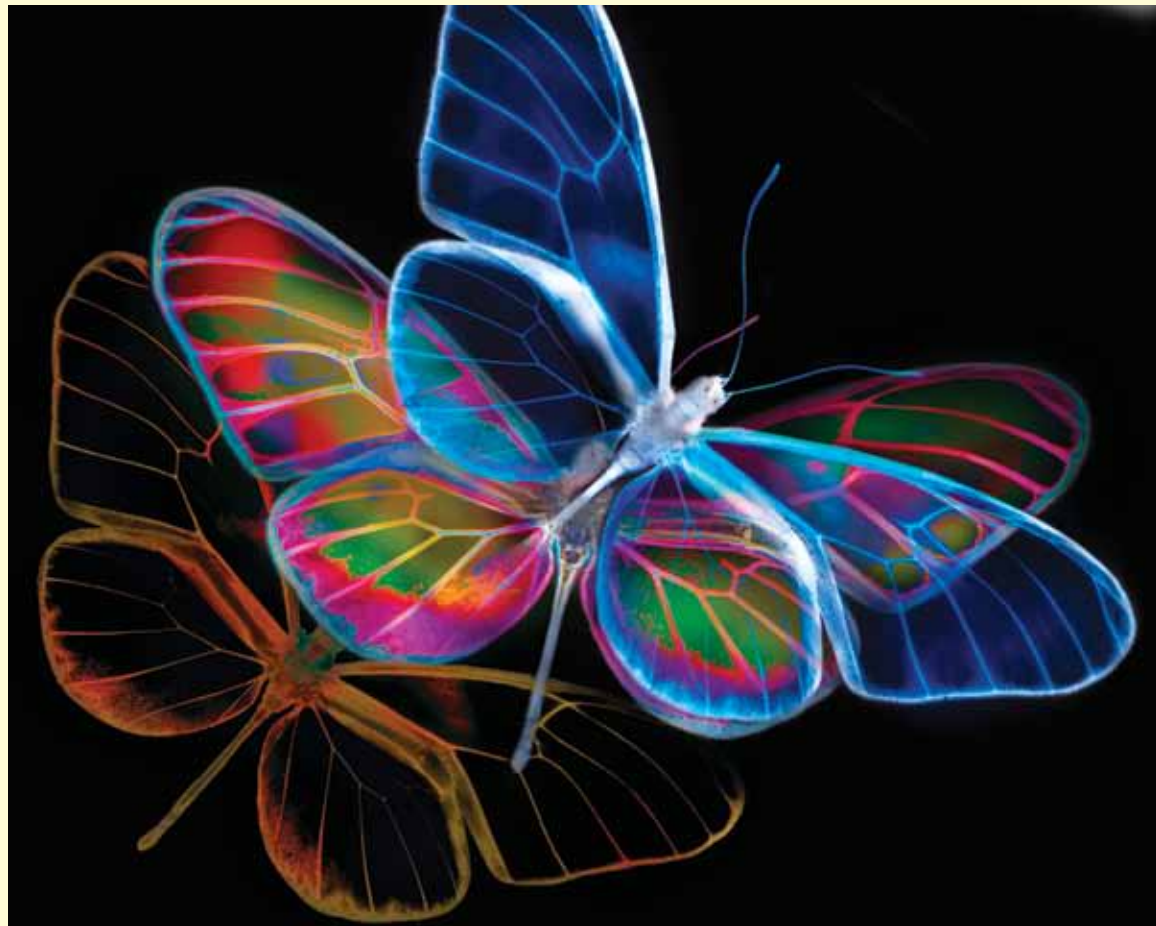
40 American Butterflies , Fall 2009

Fourth place goes to "Edge of the Earth" by Lea Wells of Littleton, CO. 30" x 40". Acrylic paint on canvas (see page 42, top).