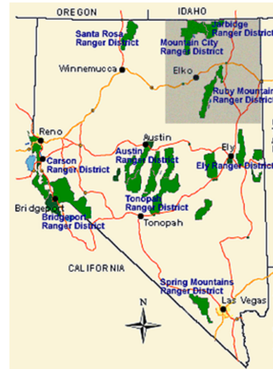
Map of Humboldt-Toiyabe National Forest, Nevada. Forests are highlighted in green. Areas discussed in this article are in a gray box.