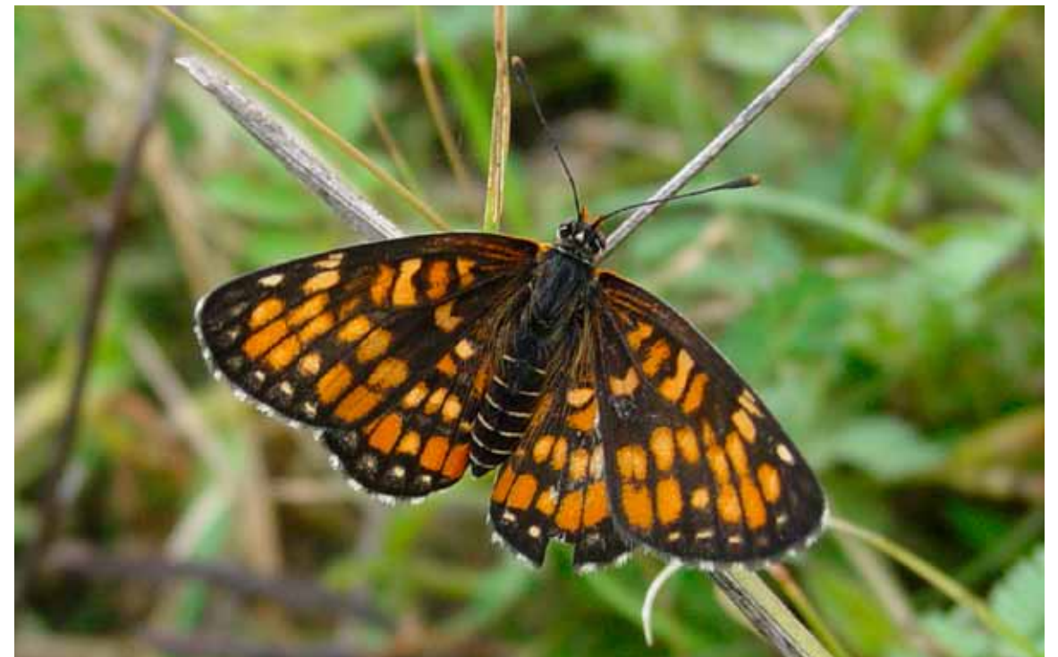
The Committee demoted Thessalia, which had heretofore included the southwestern beauties, theona, chinati, cyneas, fulvia and leanira, to a synonym of Chlosyne. Now, only Chlosyne have white spots in the middle of their head (although not all Chlosyne sport this feature). Top: Theona Checkerspot. Oct. 22, 2002. San Ygnacio, Zapata Co. TX. Bottom: Definite Patch (Chlosyne definita). Oct. 24, 2002 Loma Alta, Cameron Co. TX.