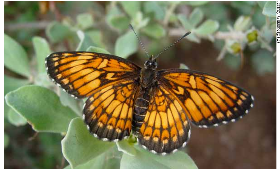
Jeffrey Glassberg (2)