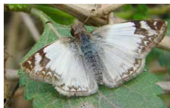
Checkered-Skippers and White-Skippers are closely related. From top to bottom: White Checkered-Skipper ( Pyrgus albescens ), Erichson's White-Skipper ( Heliopetes domicella ), East-Mexican White-Skipper ( Heliopetes sublinea ) and Laviana White-Skipper ( Heliopetes laviana ).

current generic placement creates a paraphyletic genus and that the suggested change leads to a monophyletic genus or genera. This study is principally a qualitative analysis of genitalic and wing variation. The authors do not explicitly define the phylogenetic hypotheses that they are testing (in essence, that the three species they placed in Heliopyrgus [ domicella , americanus , sublinea ] constitute a monophyletic group, and that recognizing Heliopyrgus as a genus would not make either Heliopetes or Pyrgus paraphyletic). A more structured analysis of the problem would be required to justify these changes. Even if the proposed restructuring as Pyrgus , Heliopyrgus , and Heliopetes does result in monophyletic genera, it is not clear, given the relatively small number of species in this group, that such an arrangement would be superior to placing all species in this group in the genus Pyrgus .