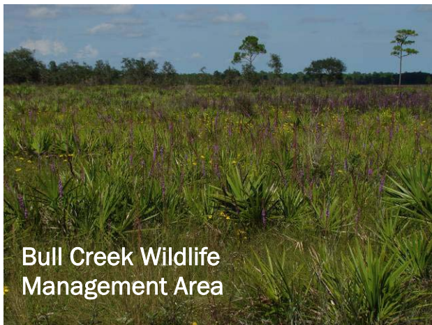
Bull Creek Wildlife Management Area