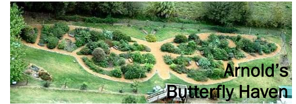
Arnold's Butterfly Haven

TRIPLE N RANCH WILDLIFE MANAGEMENT AREA - 15,391 acres. A drivable 11 mile loop, unless rains cause flooding of portions of the roads. A mosaic of natural communities include flatwoods, prairie, cypress domes and hardwood swamps. A good bloom of wildflowers can produce Florida Dusted (Loammi), Palmetto, Arogos, Palatka and Dotted and many other butterflies.