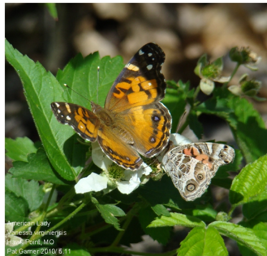
American Lady Vanessa virginiensis Hawk Point, MO 2010/ 5.11