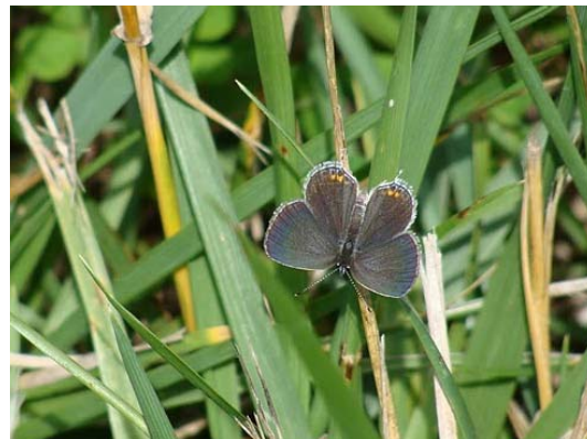
Eastern Tailed blue