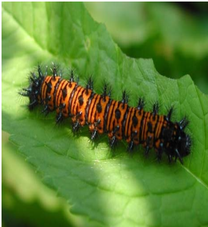
Baltimore checkerspot caterpillar

Identifying butterfly host plants can add challenge and interest to everyone's butterfly field trips. Shown are a few examples of some common and less well-known host plants, most of which can be grown in your own garden to help support an abundance of those plants in our urban environments.