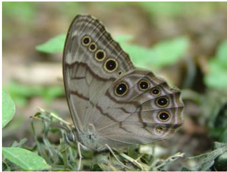
Northern Pearly Eye

At Horseshoe Lake on 5/8, Jim Ziebol saw 3 Variegated Fritillaries. On 5/9, Yvonne Homeyer saw a Variegated Fritillary at Lost Valley Trail in the same spot as the one she found the previous weekend. Four Checkered Whites at Lost Valley Trail (2 males and 2 females) were a please surprise, as was a Pepper & Salt Skipper! Also seen there on 5/9 were 5 Red-banded Hairstreaks, 1 Painted Lady, 4 Pipevine Swallowtails, 3 Spicebush Swallowtails, 1 Zebra Swallowtail, 1 Red Admiral, 8 fresh Red-spotted Purples, 3 Question Marks, 2 Silver-spotted Skippers, 2 Orange Sulphurs, 1 Juvenal's Duskywing, and 15 Pearl Crescents, for a total of 15 species. Also on 5/9, Pat Garner observed 1 Question Mark, 1 Red-banded Hairstreak, 1 Painted Lady, 2 American Ladies, 1 Common Roadside-Skipper, 3 Pipevine Swallowtails, 2 Eastern Tailed-Blues, 2 Red Admirals, and 4 Juvenal's Duskywings.