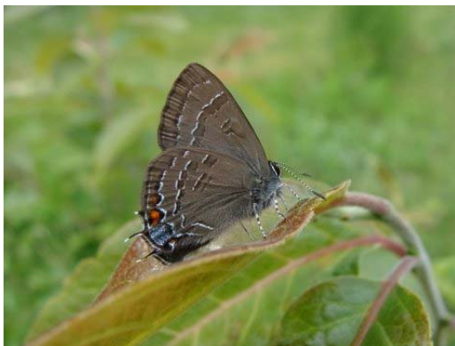
Banded Hairstreak Yvonne Homeyer

At the Garner Farm in Lincoln County on 5/22, there were 8 Summer Azures, 8 Little Wood Satyrs, 1 Gray Hairstreak, 3 Common Roadside-Skippers, 1 Northern Cloudywing, 1 Little Yellow, and 1 Red-spotted Purple.