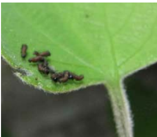
Pipevine Swallowtail caterpillars-Scott Marshall