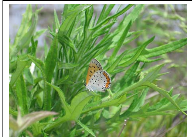
Bronze Coppers 1-June-2008 Horseshoe Lake, IL NABA 4-J count

June Sightings: We started June off with our first 4 th of July Count, at Horseshoe Lake near Granite City, Illinois. Despite a warm, sunny (and humid) day, the number of species and individuals was remarkably low. We ended up with just 20 species and 116 individuals. Highlights included 6 Bronze Coppers , 1 Little Wood Satyr, 15 Northern Cloudywings and 1 Southern Cloudywing . The entire count results are published elsewhere in this newsletter. Not seen on this year’s count were Duke’s Skipper, Broad-winged Skipper, Delaware Skipper, and Southern Dogface. Sherry McCowan, Karen Van Berkel, Jeannie Moe, Kraig Paradise, Yvonne Homeyer, and Jim Ziebol participated in the Count. Also on 6/1, Dale Hallett visited Fort Bellefontaine and saw 2 Eastern Tailed-Blues, 1 Red Admiral, 3 Painted Ladies, and 3 Least Skippers. At Mark Peters’ prairie in early June, the follow “first of year” sightings occurred: a Little Glassywing was seen by on 6/1, a Swarthy Skipper on 6/2, a Delaware Skipper on 6/5, and a Dun Skipper on 6/8.