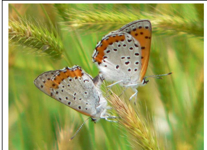
Mating pair of Bronze Coppers, 1 June 2008, Horseshoe Lake, IL