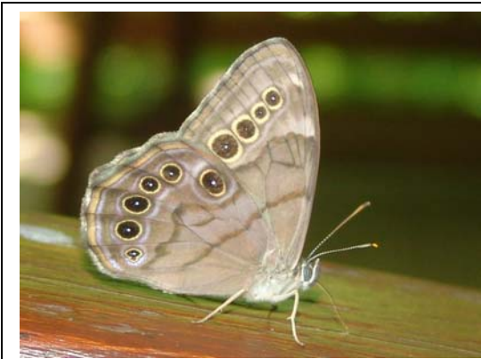
Northern Pearly-Eye 6-June-2008 Lake of the Ozarks SP