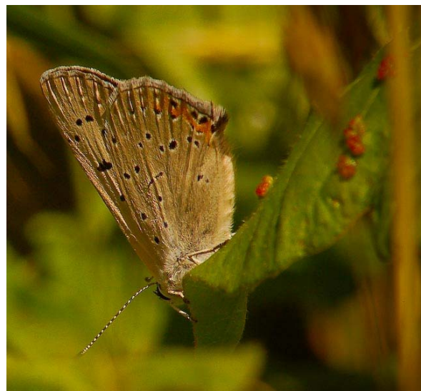
Gray Copper14-June-2008 MTC

Rather reluctantly, the group moved along to spot other butterflies as well. .the trip was more than a success with sightings of black form Eastern Tiger Swallowtail, Cabbage White, Orange Sulphur, Cloudless Sulphur, Eastern Tailed-Blue, Great Spangled Fritillary, Pearl Crescent, Painted Lady, Red Admiral, Common Buckeye, Hackberry Emperor, Monarch, Silver-spotted Skipper and Delaware Skipper. After the walk the group gathered under a shady tree for a brief break and to continue to marvel over the find of the gray copper!