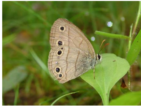
Little Wood-Satyr, 7-June-2008, Lake of the Ozarks SP

On 6/14, Scott Marshall led a field trip to Marais Temps Clair in search of the Gray Copper, a wetlands species that is in serious decline due to habitat loss. The group, which included Mary Eileen Rufkahr, Karen Van Berkel, and Anita Merrigan, found one Gray Copper , which was photographed by Anita and Scott. Also seen were 2 Black Swallowtails, 7 Cabbage Whites, 40+ Orange Sulphurs, 2 Cloudless Sulphurs, 15 Eastern Tailed-Blues, 11 Great Spangled Fritillaries, 1 Pearl Crescent, 15 Painted Ladies, 17 Red Admirals, 10 Buckeyes, 2 Hackberry Emperors, 5 Monarchs, 4 Silver-spotted Skippers, and 1 Delaware Skipper. No Gray Coppers were found when Yvonne visited MTC on 6/21, and far fewer butterflies were flying, although it was a hot, sunny day. Yvonne saw 2 Black Swallowtails, 20+ Orange Sulphurs, 1 Clouded Sulphur, 1 Cloudless Sulphur, 2 Little Yellows , 3 Great Spangled Fritillaries, 1 Buckeye, 10 Eastern Tailed-Blues, 1 Pearl Crescent, and 1 Viceroy.