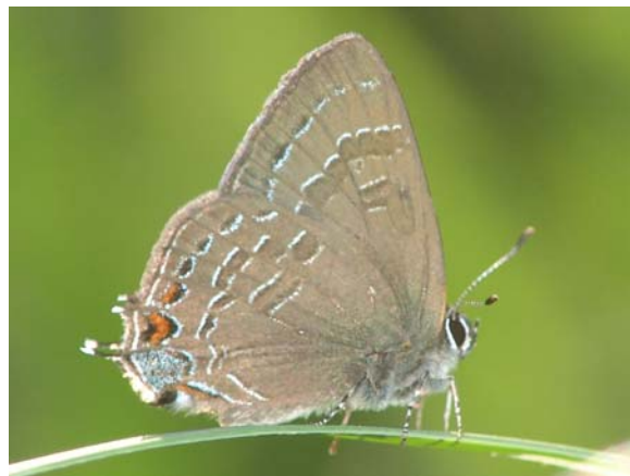
Banded Hairstreak, 6-June-08, Lake of the Ozarks SP, Camden Co. MO

Cloak, and Monarch caterpillars. At Busch C.A. on 6/6, Giant Swallowtail, Summer Azure, a Gray Comma, and Least Skipper were flying, and at the Garner Farm, a Buckeye and a Summer Azure were found (PG). On a trip to Valley View Glade on 6/8, Scott Marshall saw 1 Hickory Hairstreak , 2 Variegated Fritillaries , 2 Pipevine Swallowtails, 1 Northern Cloudywing, 1 Summer Azure, 2 Eastern Tailed-Blues, 1 Buckeye, 2 Hackberry Emperors, 2 Pearl Crescents, 10+ Little Wood Satyrs, 1 Tawny-edged Skipper, and 1 American Lady. Sherry McCowan reported a Gray Comma at Busch C.A. on 6/8.